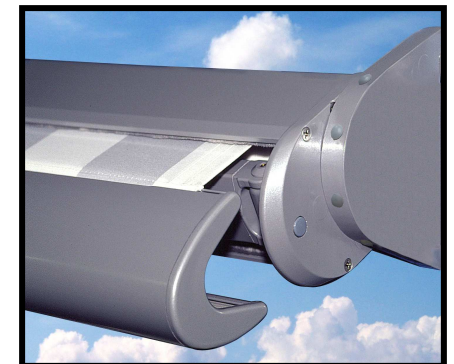
Rounded Profile – integrated housing